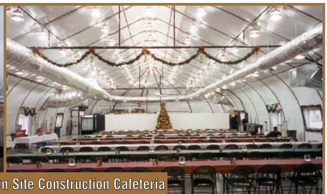
400 Seat, Fully Insulated On Site Construction Cafeteria