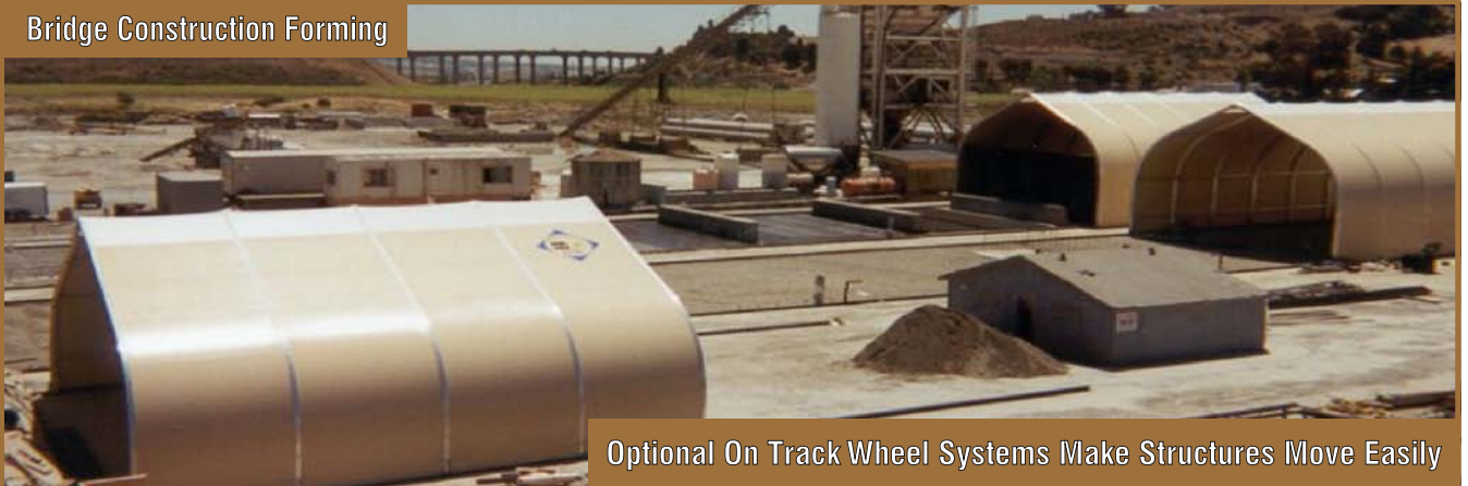
Optional On Track Wheel Systems Make Structures Move Easily