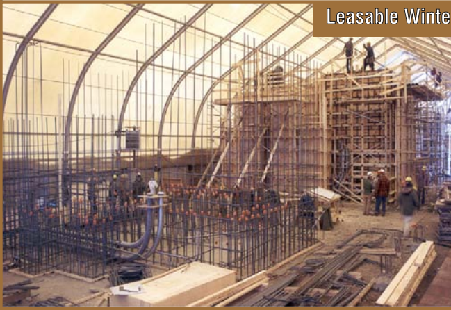
Leasable Winter Hoarding Solutions