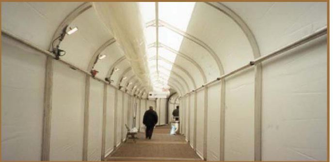
Enclosed Pedestrians Walkways During Construction