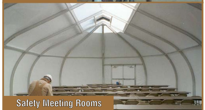
Safety Meeting Rooms