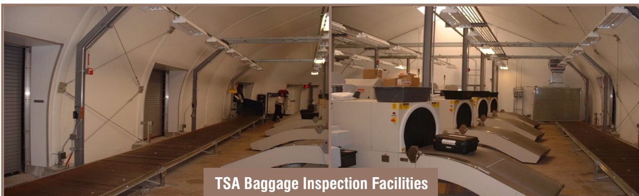
TSA Baggage Inspection Facilities