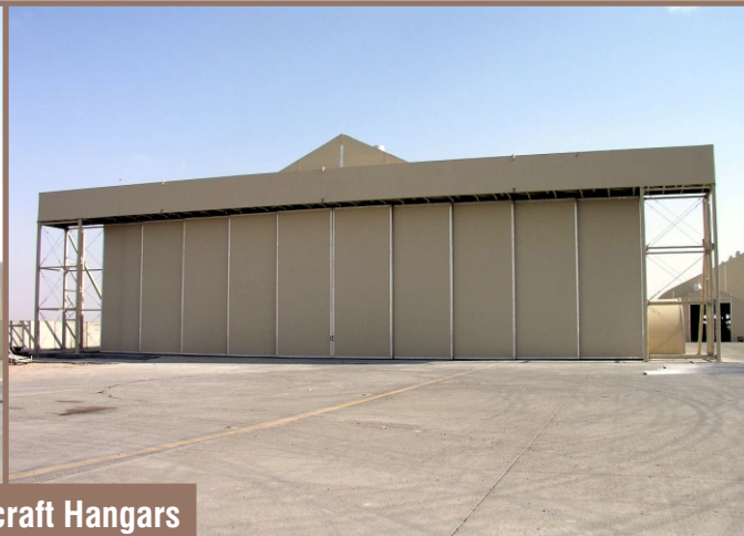
Relocatable Aircraft Hangars