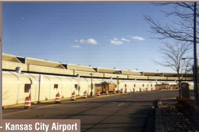
Passenger Corridors - Kansas City Airport